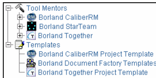
Tool Mentors and Templates as they appear in the RUP® browser

The RUP® “Plug-In for ALM” is a plug-in that extends the standard RUP® with tool mentors and templates for the Borland® ALM tools. It provides a bridge between the tool-independent RUP® activities and the Borland® ALM tools to implement these activities. It describes how to automate the steps of activities using the capabilities of the Borland® ALM tools. It includes tool mentors and templates for Borland® CaliberRM™, Borland® StarTeam® and Borland® Together®.